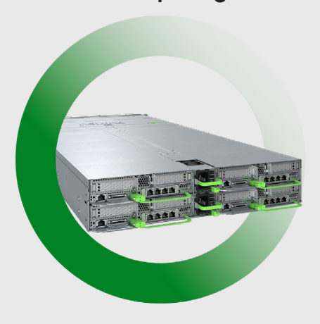
Modular and density-optimized servers to scale efficiently