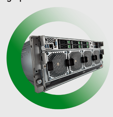
GPU accelerated servers suited for advanced and futuristic workloads

Customer-inspired and innovative technology is integrated into every Fujitsu PRIMERGY server, offering exceptional performance, efficiency and reliability, from small business offices to enterprise data centers and hyper-scale environments.