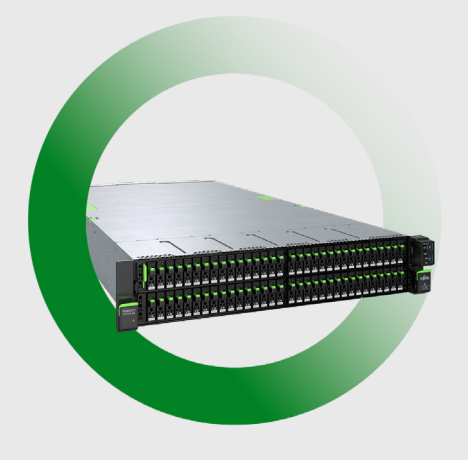
Versatile rack servers with leading efficiency and performance