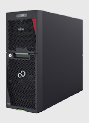
Expandable all-rounder that delivers great performance at an economic price