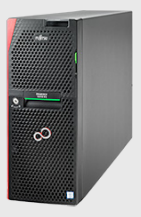
Tower powerhouse with the richest feature set

Robust and cost-efficient Tower Servers that are affordable and expandable.