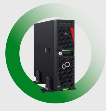
Robust and cost-efficient servers characterized by simple and quiet operations